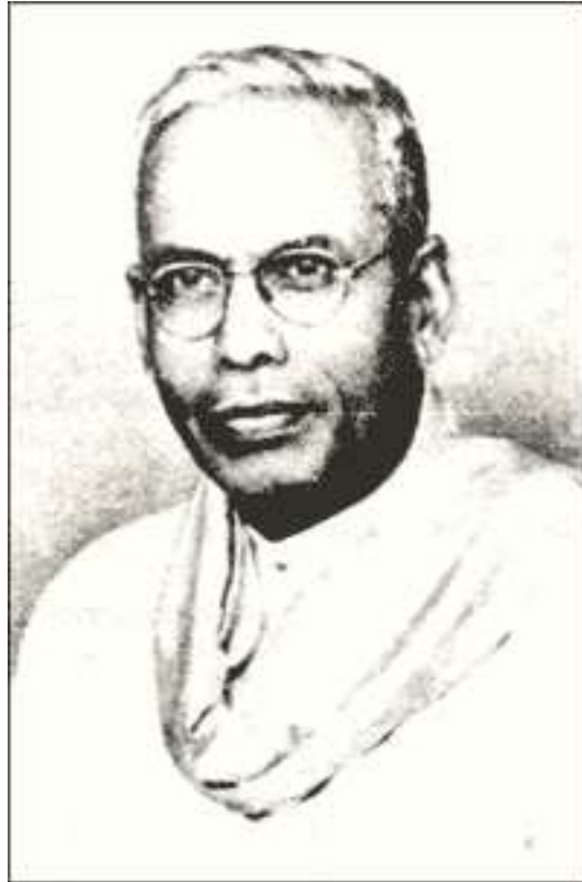
Figure 1: Shiyali Ramamrita Ranganathan